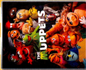
Disney THE MUPPETS

8:30 a.m., 4:00 & 10:30 p.m. Run Time: 1 hr 18 mins Rating: G